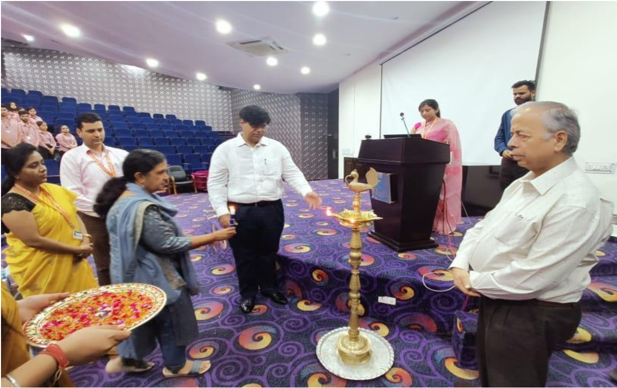
Lamp lighting by the dignitaries