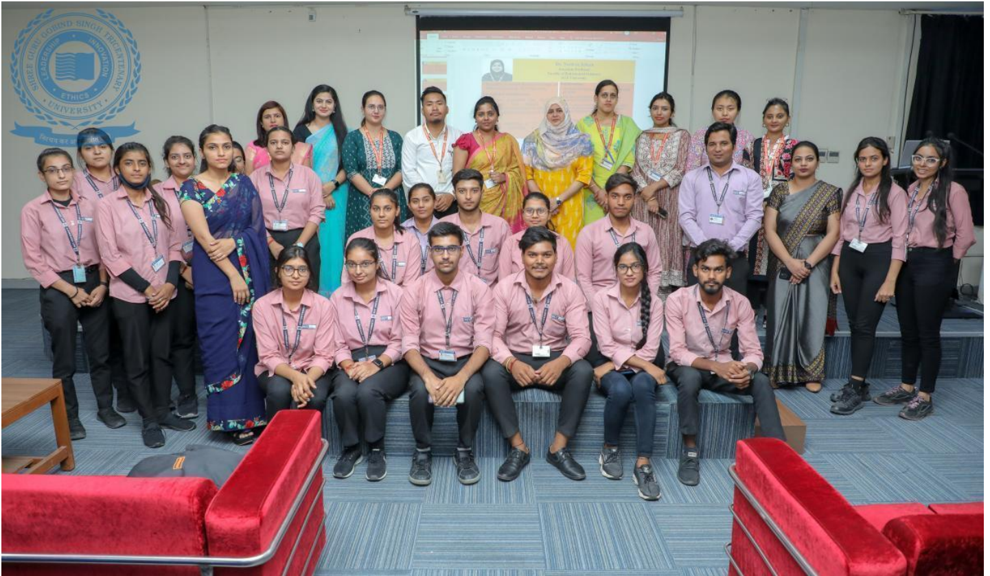
Dignitaries, organizers and the students