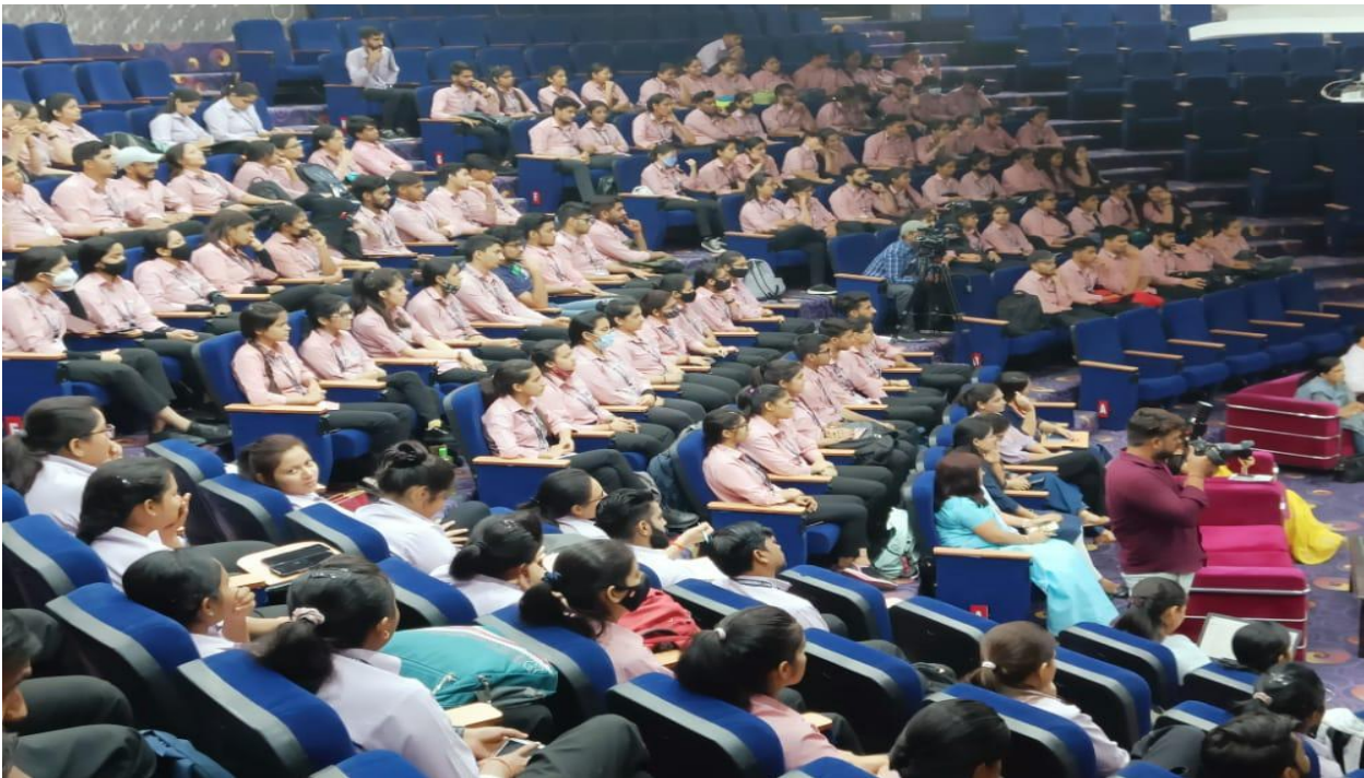
Students attending the session