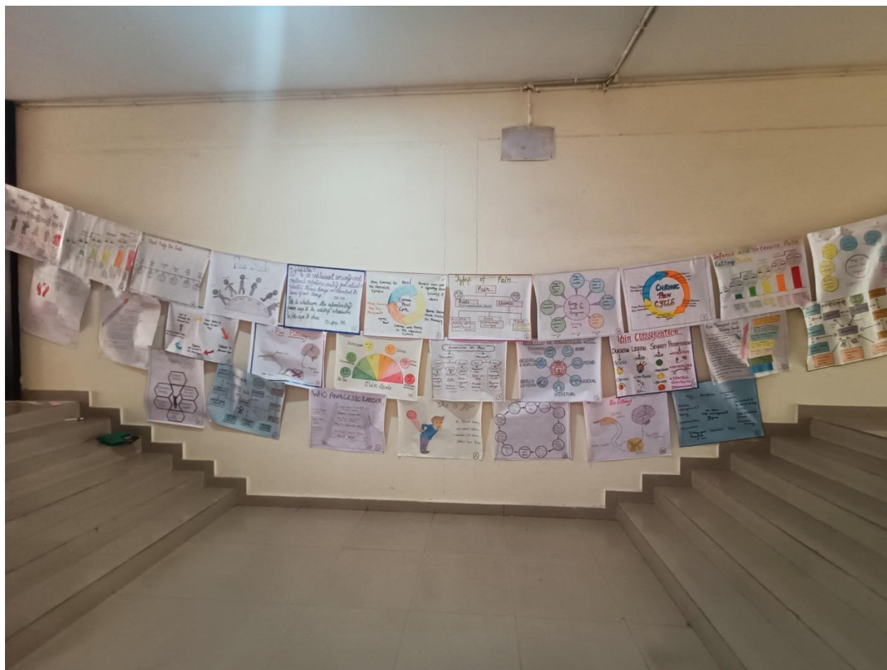
Poster competition display