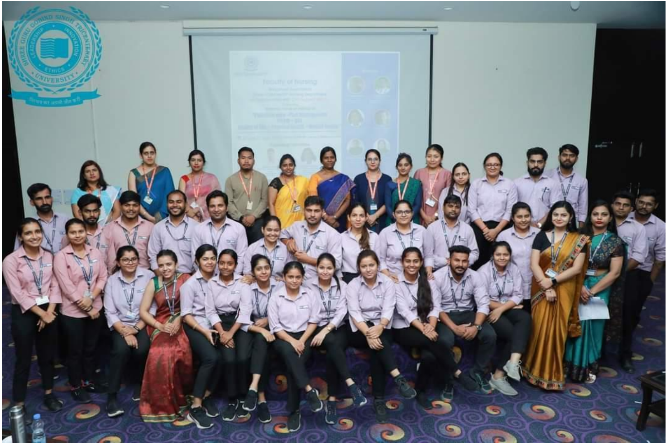
Organizers and Participants of the workshop